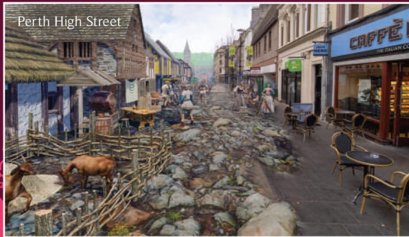
Perth High Street