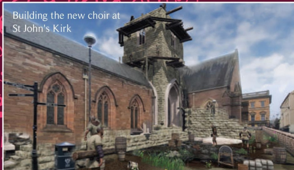
Building the new choir at St John's Kirk